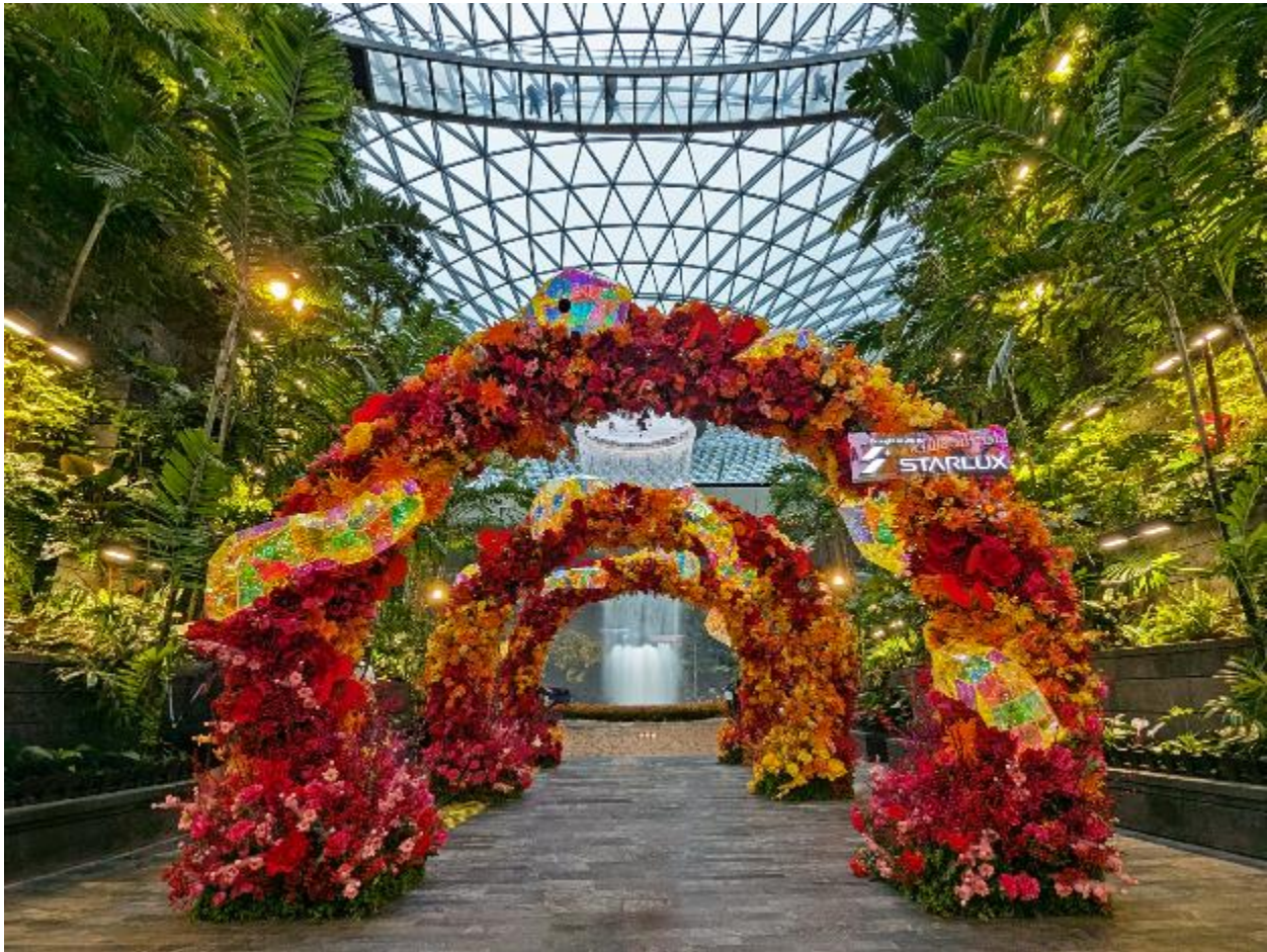
Welcome the Year of the Snake with STARLUX Airlines at Jewel

Kickstart your travel adventures in the new year with STARLUX Airlines at Jewel! With a minimum spend of S$38 in a single receipt at Canopy Park, visitors will receive a scratch-and-win card for a chance to win a pair of business class tickets to Taipei, courtesy of STARLUX Airlines. Other exciting prizes include Jewel tenant vouchers, attraction vouchers, retail vouchers, and adorable Jewel mascot plushies. You can also redeem an adorable POP MART Chinese New Year sticker pack with the same receipt.