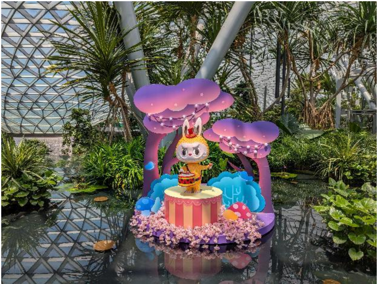
LABUBU at the Source Pool

Visitors to Canopy Park will be warmly welcomed by Sweet Bean and PINO JELLY, beckoning the arrival of guests to Canopy Park and into this POP MART paradise. Then, meet with MOLLY, SKULLPANDA, LABUBU, DIMOO, Hirono and CRYBABY at Petal Garden amidst a display of festive florals. Witness a whimsical concert by LABUBU at Source Pool or follow HACIPUPU as he embarks on a delightful journey through a magical forest near Discovery Slides.