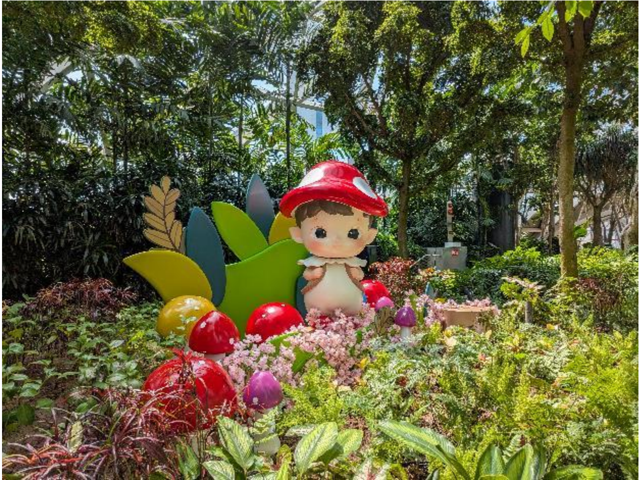
HACIPUPU at the Discovery Slides

At Foggy Bowls, pose with more POP MART characters including MOLLY, SKULLPANDA and DIMOO from various popular series - DIMOO from the "Weaving Wonders" series, MOLLY from the "School Life of MOLLY" series, and SKULLPANDA from the "Warmth" series.