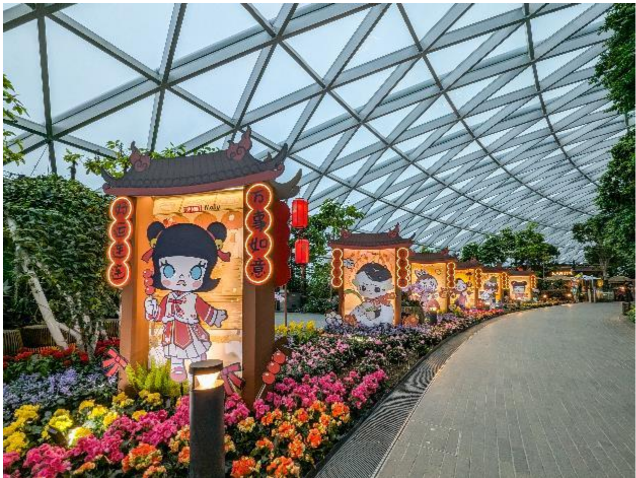
Celebrate the Year of the Snake with POP MART at Canopy Park

Singapore, 10 January 2025 – Get ready to welcome Lunar New Year at Jewel Changi Airport (Jewel), where POP MART joins forces with Jewel to create a festive wonderland!