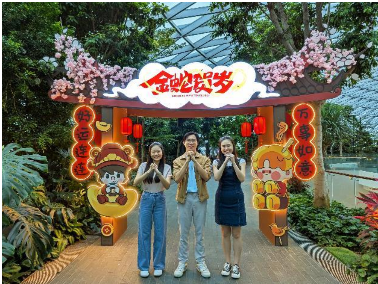
Canopy Park entrance

Canopy Park (located at Jewel's topmost floor) will showcase captivating installations from POP MART's Chinese New Year series, Wealthy Snake's New Year Celebration , that includes the first block blind box set and New Year-themed products inspired by traditional Chinese culture.