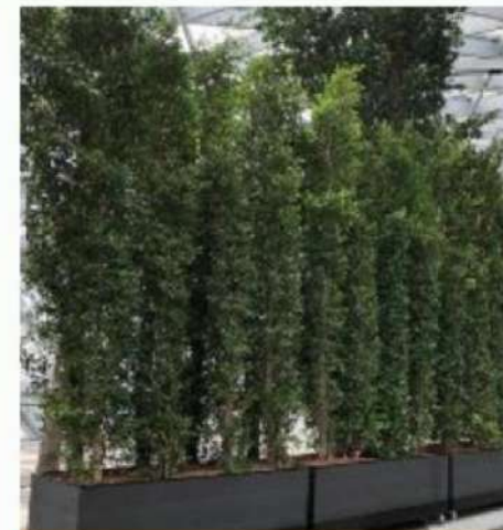
Hedges for Privacy