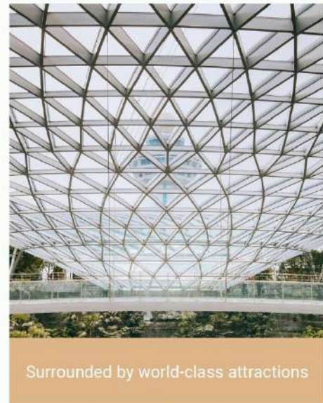
Surrounded by world-class attractions