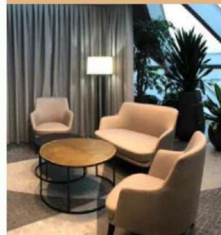
Holding rooms to host VIPs

Under pleasant natural daylight or the romance of the night skies, beautiful trees located amid Cloud9 Piazza add to the idyllic garden setting of events. Events enjoy privacy provided by majestic full height garden hedges, which make for picturesque backdrops of greenery. Located at the two ends of the plaza are two (2) glass house private rooms, suitable for private hosting of guests or use in between events.